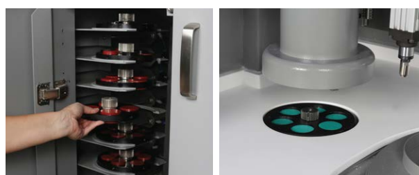
Automatic Sample Holder Feeding Unit