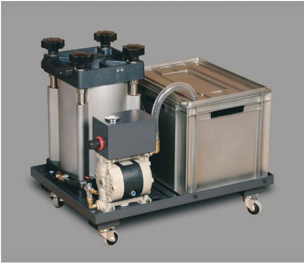
Enviro recirculating filtering unit