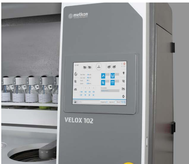
Programmable HMI touch screen controls