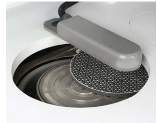
Automatic Disc Replacement Unit