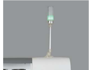
3 Lights Signal Beacon