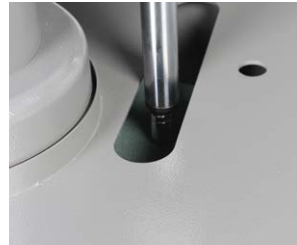
Automatic Dressing Unit

Informs operator about machine status from the long distance.