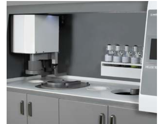
Operator-Free Sample Preparation