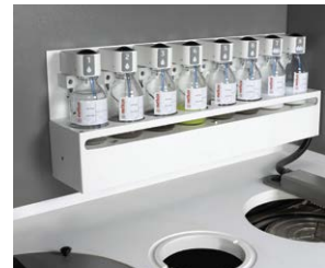
Automatic Fluid Dispenser