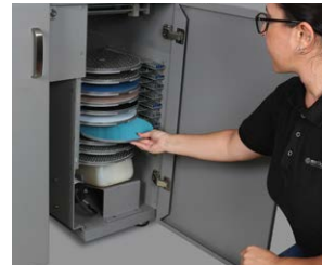
Grinding/Polishing Disc Storage for Automatic Disc Replacement

VELOX 102 is equipped with automatic peristaltic dosing system with 8 peristaltic pumps [ 6 for diamond suspensions/lubricant and 2 for aluminum oxide suspensions]. The automatic peristaltic dosing system is used in combination to obtain consistent specimens and to save time and consumables. Both diamond suspensions/lubricants and aluminum oxide suspensions can be fed. Dispensing parameters like; frequency, fluid selection etc. are controlled through the LCD screen of the VELOX 102. High quality peristaltic pumps guarantee exactly the same dosing every time. Pre-dosing function lubricates the polishing cloth before each operation to increase the life of polishing cloth and obtain perfectly polished specimen surfaces. The suspensions and lubricants that are remained in the dosing tubes retract back at the end of every step to eliminate the risk of contamination from coarse abrasive on a finer grain size with auto retract function. Automatic Liquid Level Calculation of suspensions and lubricants is also available and can be monitored through the LCD screen of the VELOX 102. The calibration can be carried out when a lubricant or suspension is filled. The operator will be informed to refill the bottle when the suspension/lubricant level is below the critical value. All bottles have a magnetic stirrer inside to prevent sedimentation of suspensions and make more homogenous abrasive distribution inside the suspension.