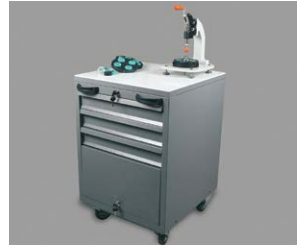
Stand For Levomat