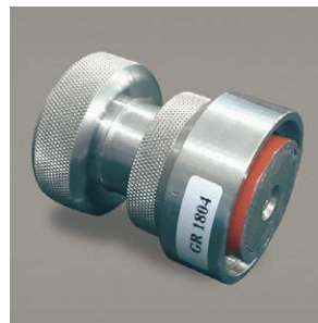
Magnetic Type Sample Holder

Magnetic and mechanical specimen holders for samples up to 50 mm. dia. available ensure maximum operator safety.