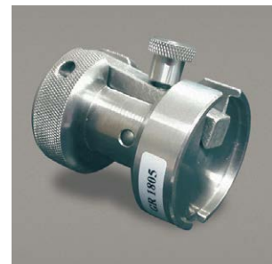
Mechanical Type Sample Holder