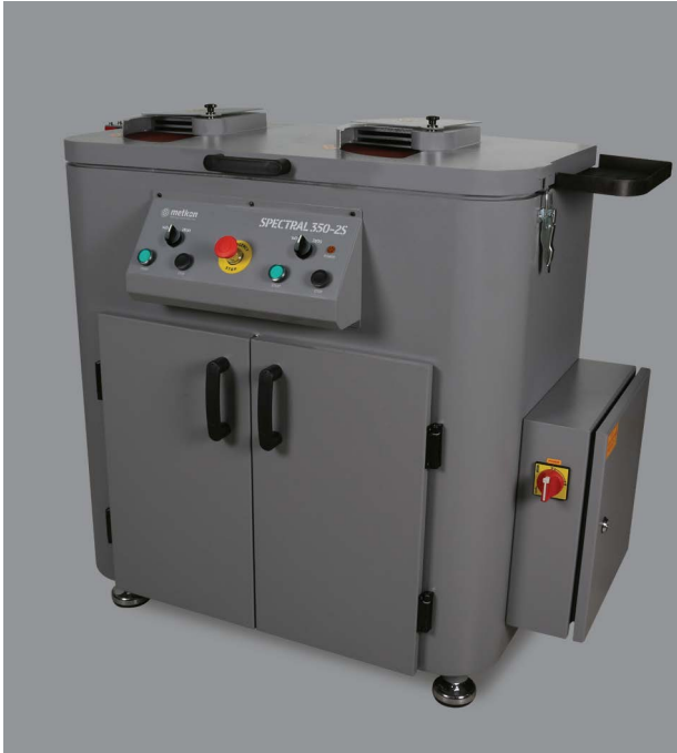
SPECTRAL 350-2S Double Disc Surface Grinder

SPECTRAL 350 is used to achieve excellent precision flat surfaces of iron and steel samples for spectroscopic analysis. The robust and vibration-free construction has been designed for continuous operation at high sample throughput.